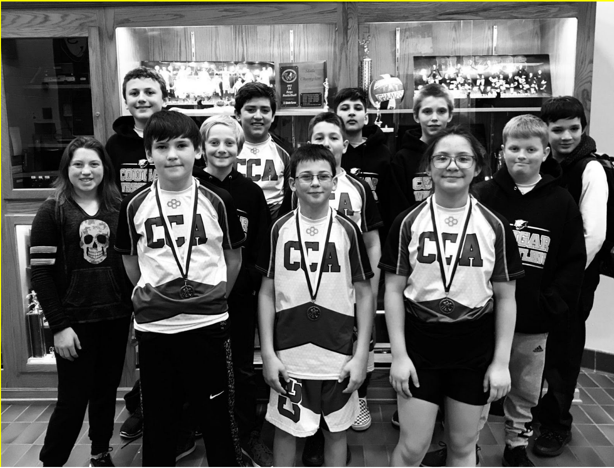
Cougar Wrestlers at Torrington Tournament