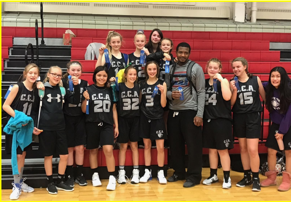
7A/B Girls Basketball - A & B City Champions 2018

* Nordic Ski practice starts January 3rd.